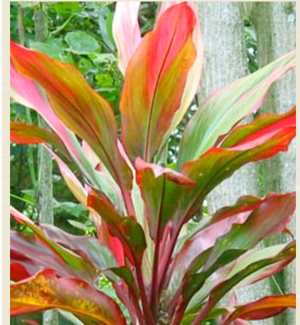
Ti Leaf--The ancient healing plant of Hawaii

Complementary Breast Cancer Treatment Fund